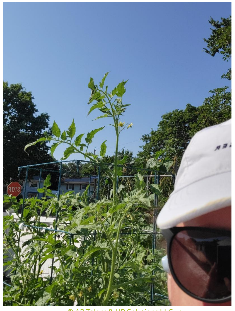
© AB Talent & HR Solutions LLC 2024